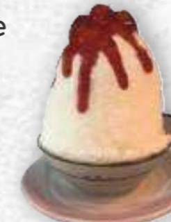
Strawberry Yogurt Kakigōri

milk ice fresh strawberry cheesecake cracker crumbs whipping cream strawberry purée