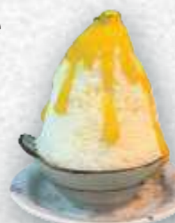
Mango Yogurt Kakigōri

milk ice fresh mango cheesecake cracker crumbs whipping cream mango purée