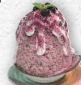
Mont Mauve Kakigōri

watermelon ice lychee nata de coco chocolate chips