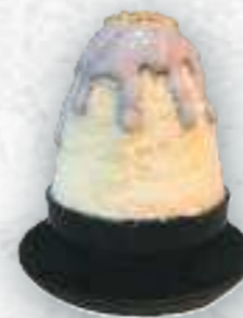
Mont Fuji Kakigōri

melon milk ice fresh honeydew nata de coco almond flakes