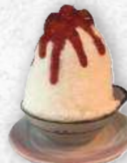
Strawberry Cheesecake Kakigōri