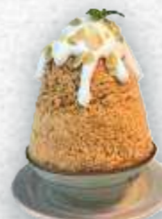
Thai Tea Kakigōri

hojicha ice kuromitsu jelly whipped cream kinoko powder almond dice kuromitsu syrup