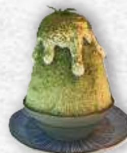
Matcha Latte Kakigōri

mix berry ice fresh strawberry blueberry raspberry whipped cream kuriaro rose powder