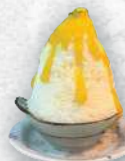
Mango Cheesecake Kakigōri

milk ice kuromitsu jelly garrett popcorn caramel toffee sauce